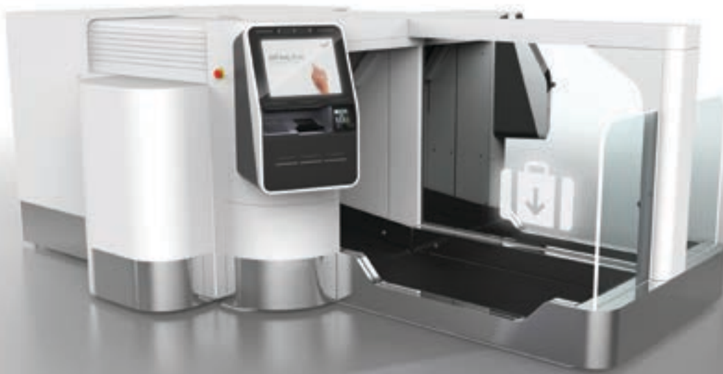
Rotating Desk Hybrid

Self-service or conventional, ICM's best-in-class technology delivers the ultimate passenger experience