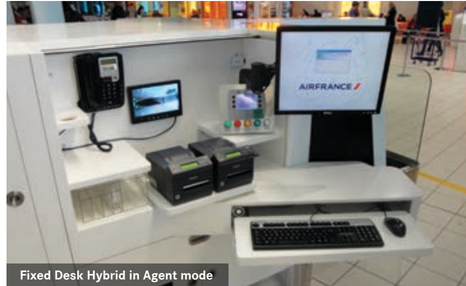
Fixed Desk Hybrid in Agent mode