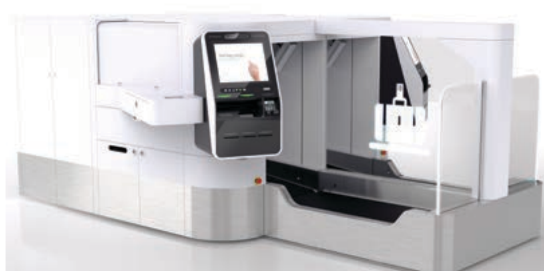
Fixed Desk Hybrid